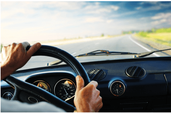
Sessions take place at CHHS in room 105

Parents/guardians will be required to complete Safeway's Account Verification. Safeway will send out an email before class begins that gives detailed information about how to login to the student's Safeway account to verify and complete contact information and to review and acknowledge our Service Agreement.